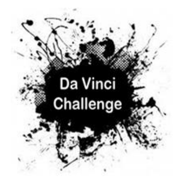
The Monthly Da Vinci Challenge - June